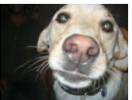
Figure 1. shane.jpg

This executes a single convert command, hiding from the user features such as remote multisite execution and fault tolerance that will be discussed in a later section.